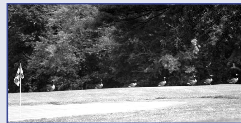
A group of geese look for a way to join the sold out event.